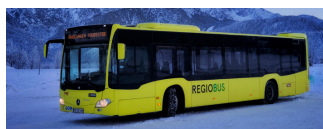
WE.VVT day ticket for bus & train