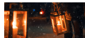
WE.Highlights & events