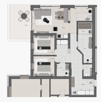
1-4 Personen · 2 Bedrooms · 89 m<sup>2</sup>