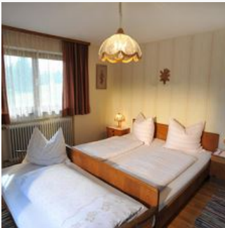
4-9 Personen · 1 Bedrooms

Our Appartement is commodiusly with nice facilities. Balkony and separate kitchen.