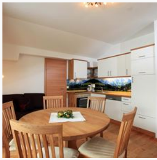
2-5 Personen · 2 Bedrooms · 50 m<sup>2</sup>