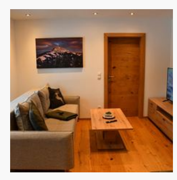
1-4 Personen · 2 Bedrooms · 60 m<sup>2</sup>